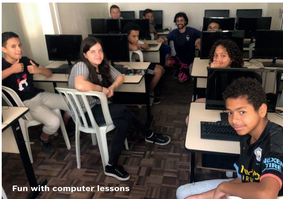
Fun with computer lessons

Financially, the inclusion of autistic people has created a gap, which is the reason for why I am convinced that it is right and helpful for the NGO to include it in our Primavera supporting program. Our Primavera board has therefore also unanimously approved support for Projeto Vida in our first board meeting in January 2023.