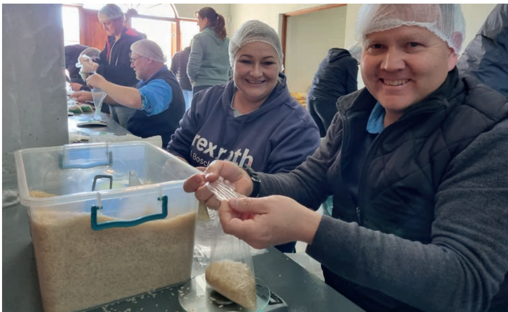
Helping hands with repacking of food stuffs

Since 2021, Primavera has been supporting the „Operation Antifreeze“ project in South Africa. This involves school meals for children in eleven schools in the greater Pretoria area, near the Bosch-Rexroth site. See also the article in Newsletter 1/2022.