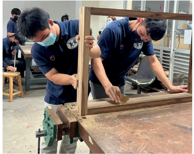
Young trainees in the „Skills for Life“ project make toys for the children from „Hand to Hand“ project

It was the beginning of a great cooperation between the two projects, which is regularly promoted and accompa-