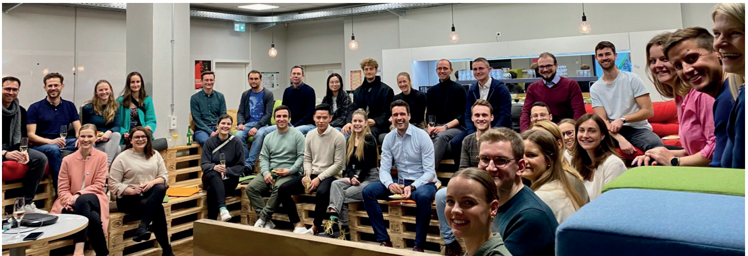
Trainees' Afterwork Event in the Stuttgart Connectory

to raise awareness and support Primavera. The profit from the event: 800 euros. We are very impressed by everyone's dedication, energy and motivation to help children in need, and we enjoyed the exchange very much.