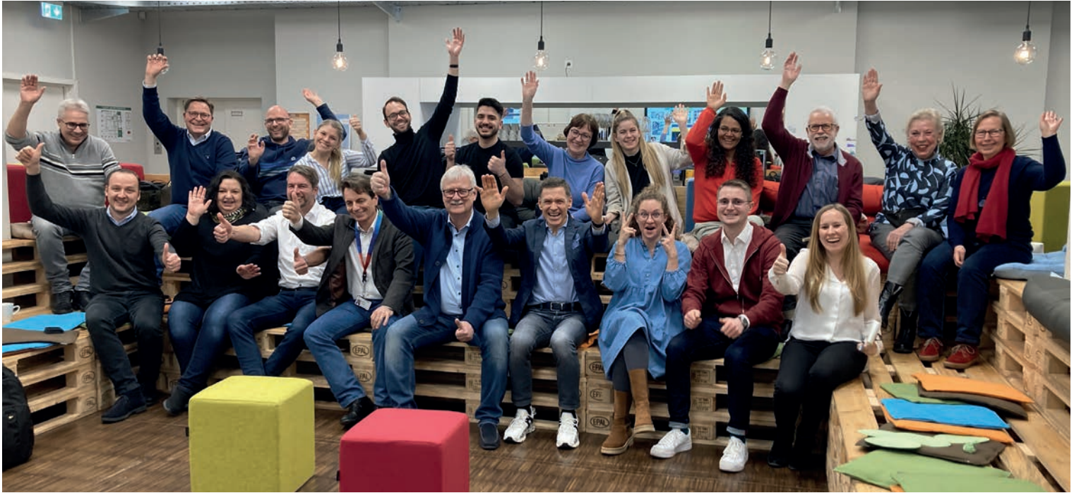
Creative ideas in a creative environment

The annual strategy workshop offers the opportunity to look at current status of Primavera e.V. and to discuss the future direction. In February 2023, about 20 highly motivated participants met at the Connectory in Stuttgart to derive measures for achieving the goals. In order to be able to continue to actively help children and young people in developing and emerging countries, the main objective is and remains a significant increase in the level of donations. This can only be achieved if we continue to raise awareness of Primavera both inside and outside Bosch, use ambassadors for local activities and focus even more on the opportunities arising by using social media and digitalization. We need integrated communications across all channels; Primavera's presence in our media needs to be more professional, consistent, and trust-building. To improve our internal and external communication about activities, progress in the many projects and other association activities, we have set up a team and developed an appropriate strategy. Five work packages that we had already defined in 2022 have now been confirmed and impetus given to the working groups for further work via feedback and new ideas.