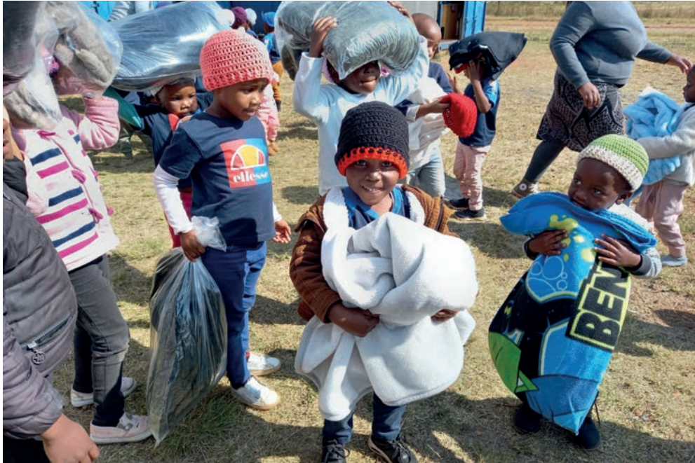
Warm winter blankets for the kids